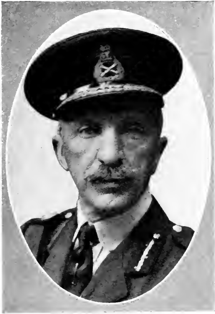
The late FIELD-MARSHAL SIR H. WILSON